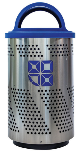
Custom logos available!