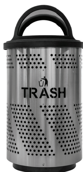
ARENA-X51 T SS/BLK