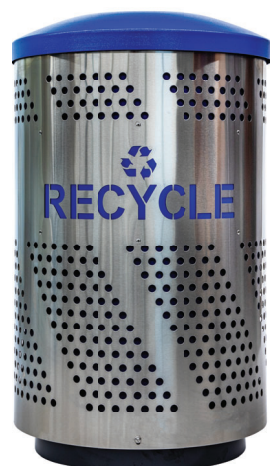
ARENA-51 R SS/RBL