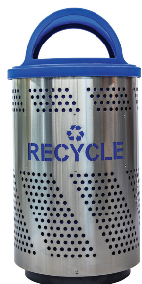
ARENA-X51 T R SS/RBL

Ex-Cell Kaiser's new ARENA 51 Series receptacles are ready to provide facilities with a stellar solution for the collection of waste and recycling. Designed for indoor or outdoor use, the ARENA 51 provides customers with an attractive, completely customizable receptacle that ensures a perfect fit for any facility; custom colors, custom logos or both - the ARENA 51 gets the job done!