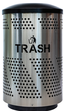
ARENA-51 T SS/BLK