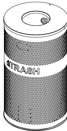
PERSPECTIVE 33 GALLON RECEPTACLE