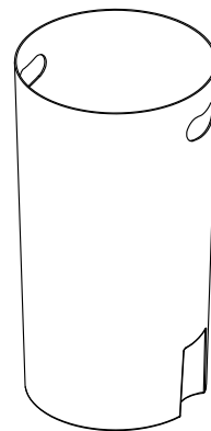
PERSPECTIVE 33 GALLON LINER

PERF PATTERN: 1/2" DIA HOLES ON 3/4" STAGGERED CENTERS