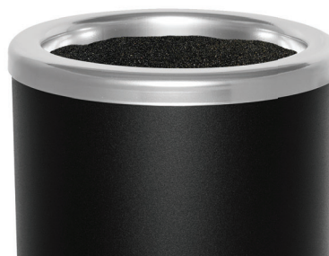
160S BLX (with 155 BLK)

One of our legacy products, these freestanding powder coated floor urns can be found in thousands of locations. Plus, get the best impressions from your sand imprinter with our extra smooth, fine grain, black silica sand.