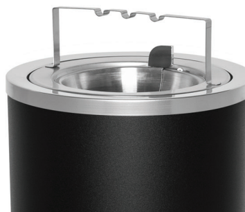
160F BG BLX