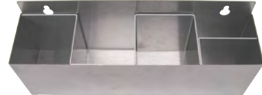
AD-SH-2 with AD-SH-5P removable partition